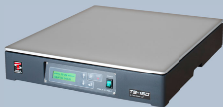
TS-150/LP front view