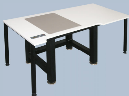
TS-Workstation: built-in active antivibration system